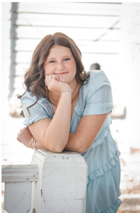
Cheyenne Efird Graystone Day School