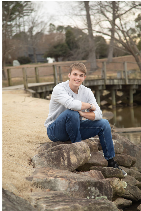
Owen Hamilton Community School of Davidson

The University of North Carolina Charlotte