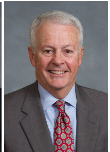
Rep. Hugh Blackwell